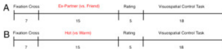
Fig. 1. Time course of Social Rejection and Physical Pain trials. The Social Rejection and Physical Pain tasks each consisted of two consecutively administered runs of eight trials (i.e., 16 total trials). The order of the two tasks was counterbalanced across participants. (A) Each Social Rejection trial lasted 45 s and began with a 7-s fixation cross. Subsequently, participants saw a headshot photograph of their ex-partner or a close friend for 15 s. A cue-phrase beneath each photo directed participants to think about how they felt during their break-up experience with their ex-partner or a specific positive experience with their friend. Subsequently, participants rated how they felt using a five-point scale (1 = very bad; 5 = very good). To reduce carryover effects between trials, participants then performed an 18-s visuospatial control task in which they saw an arrow pointing left or right and were asked to indicate which direction the arrow was pointing. Ex-partner vs. Friend trials were randomly presented with the constraint that no trial repeated consecutively more than twice. (B) The structure of Physical Pain trials was identical to Social Rejection trials with the following exceptions. During the 15-s thermal stimulation period, participants viewed a fixation cross and focused on the sensations they experienced as a hot (painful) or warm (nonpainful) stimulus was applied (1.5-s temperature ramp up/down, 12 s at peak temperature) to their left volar forearm (for details, see Methods ). They then rated the pain they experienced using a five-point scale (1 = very painful; 5 = not painful).